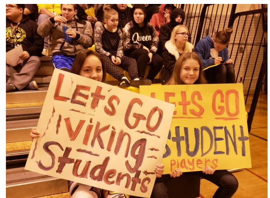
Students cheering on their classmates at the Staff v Student volleyball game convocation on January 11th.